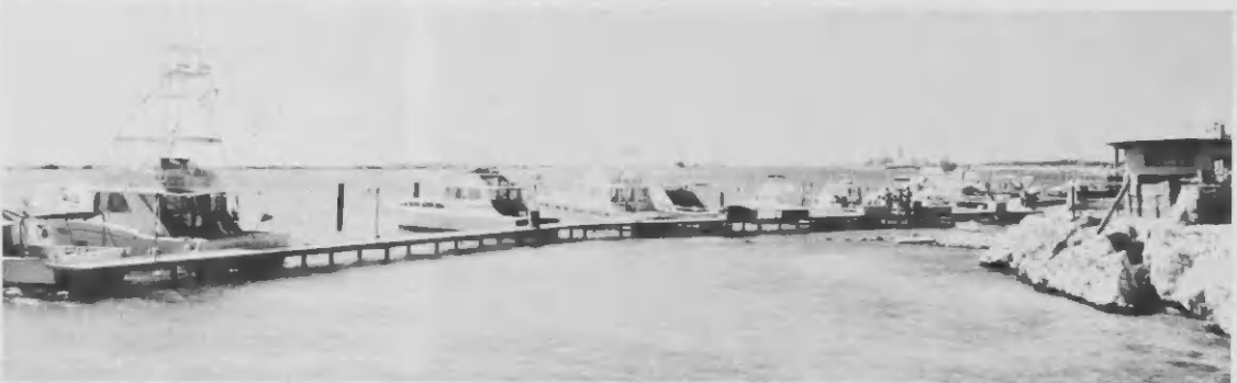
Some of the participating yachts at Aruba Nautical Club's marina.